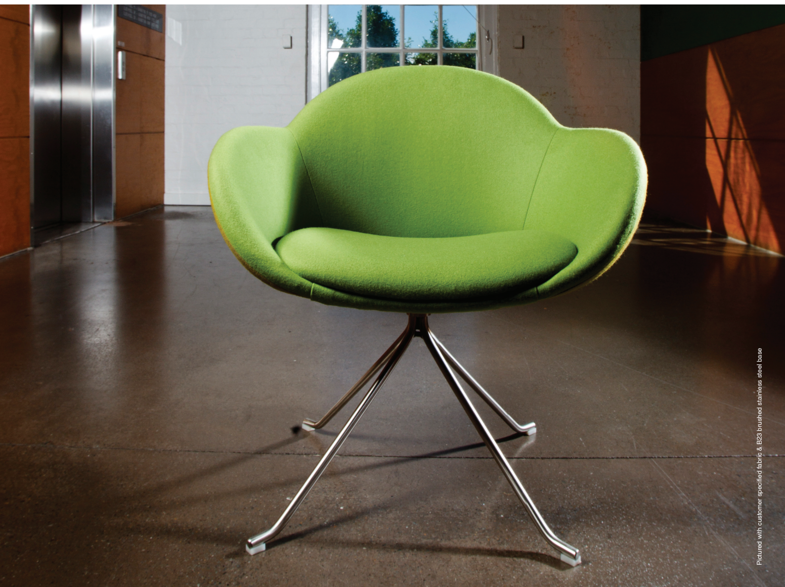
Pictured with customer specified fabric & B23 brushed stainless steel base