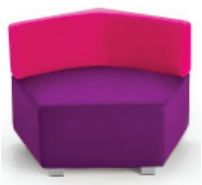
Other Configuration Options