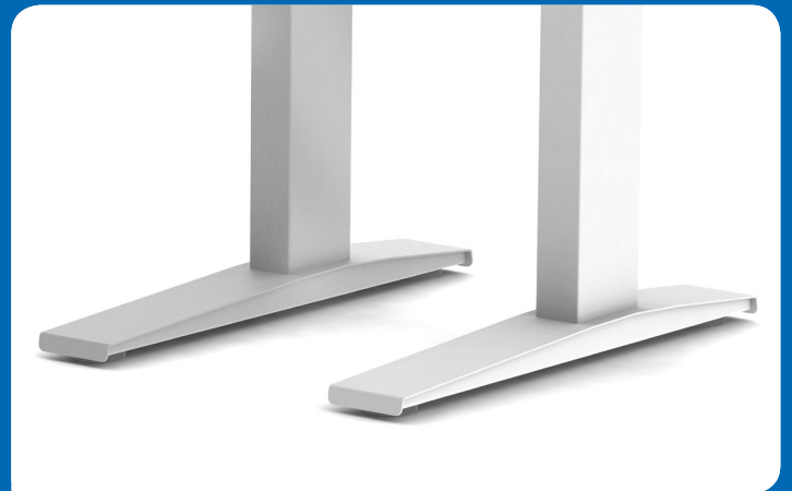
Available in Pearl White and Precious Silver as standard