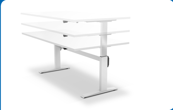
Height Range: 610mm to 910mm (including 25mm worktop)