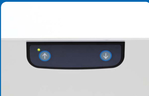
Sit 'N' Stand Electronically Operated Height Adjustable Desk Frame