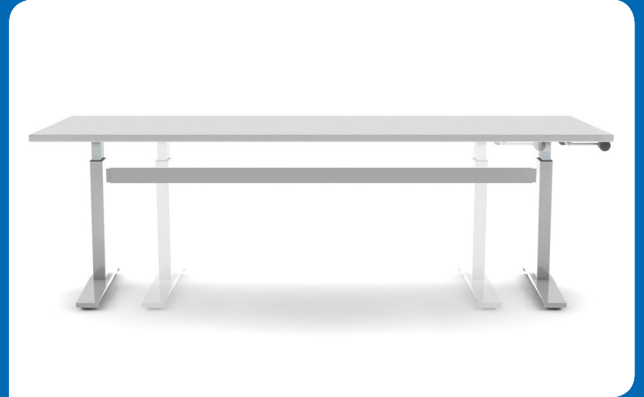
Adjustable beam suits worktops 1500mm to 2400mm